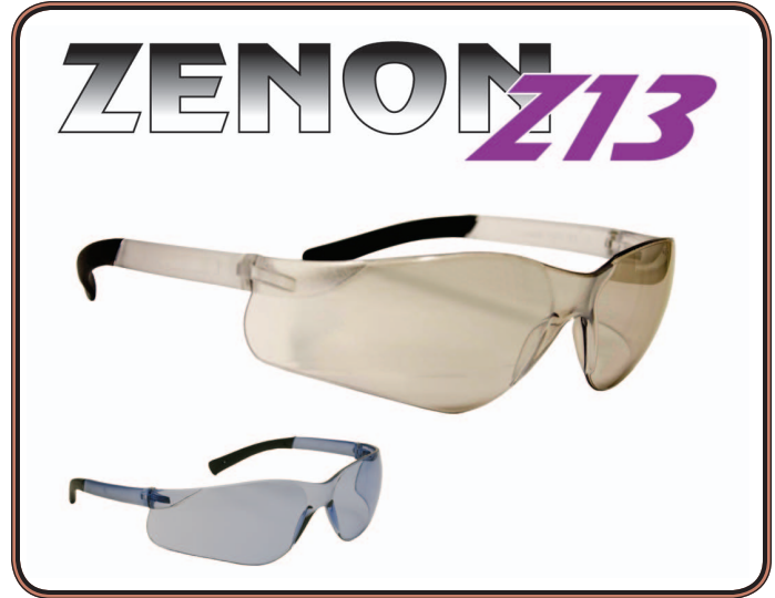
Polycarbonate lenses block 99.9% of the sun's ultraviolet rays. This ultraviolet protection has already been incorporated within the lens material when the lenses are being produced.

Country of Origin/Harmonization Code: Taiwan/9004.90.0000